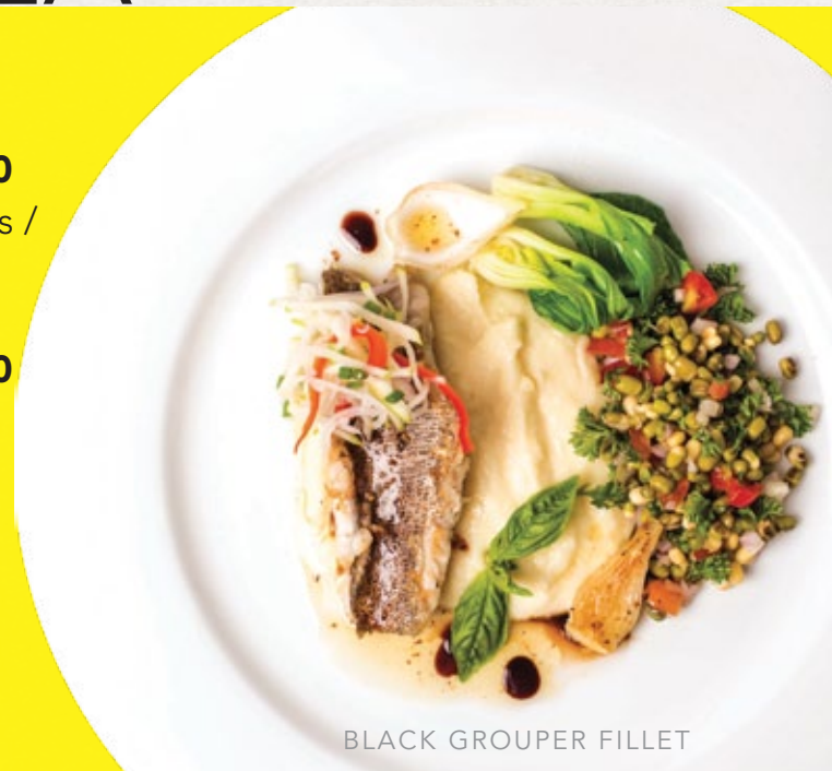
BLACK GROUPER FILLET

Fennel-orange salad / beetroot / avocado / tomato salsa / lime caper cream