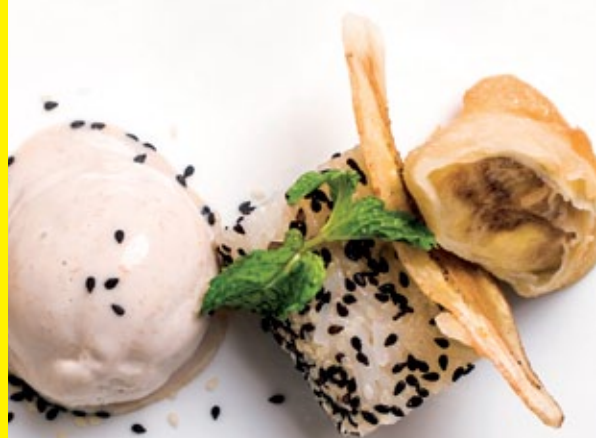
EAST 88 BANANA SPLIT

EAST 88 BANANA SPLIT 260 Banana spring rolls / banana maki / banana chips / banana ice cream